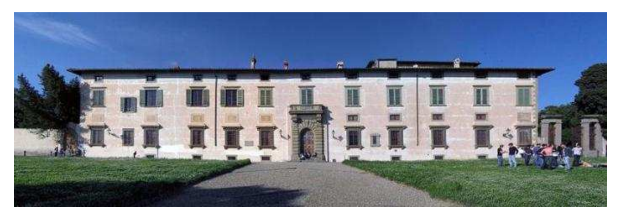
Villa Medici di Castello in Florence, Italy where Caterina served much of her house arrest